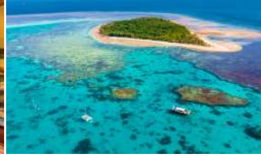
Stunning Scenery & Wildlife