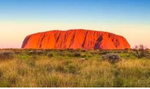
Iconic World-Famous Sites