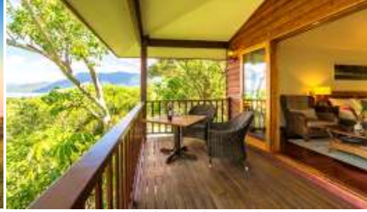
Beautiful Hotel Locations