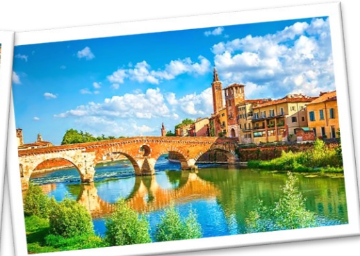
Explore Beautiful Towns and Cities like Verona