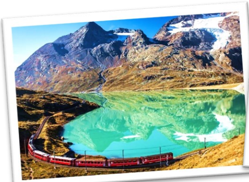
Travel on Famous Bernina Express