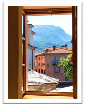
Three Intimate Country/Village Style Hotel Stays across Fourteen Nights of Touring.