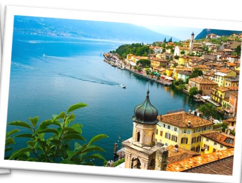
Stay in Stunning Villages like Limone Sul Garda