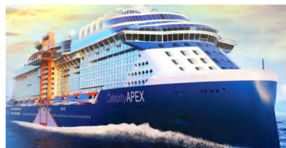
Stunning New Celebrity Apex